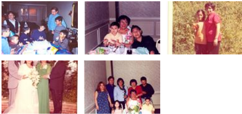
Roslyn Heights Funeral Home - January 22, 2022 at 04:47 PM

“ 51 files added to the album LifeTributes